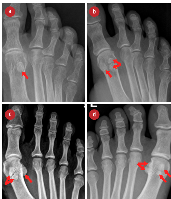
Figure 1: Radiographs (anterior-posterior views) showing rare distributions of sesamoid bones at the first metatarsophalangeal joint. (a) Single sesamoid bone (red arrow); (b) and (c) unilateral bipartite sesamoids (red arrows); and (d) bilateral bipartite sesamoids (red arrows).

*No significant difference across age groups for right and left side joints; # p = 0.030 (right side joint across age groups); * p < 0.010 (left side joint across age groups).